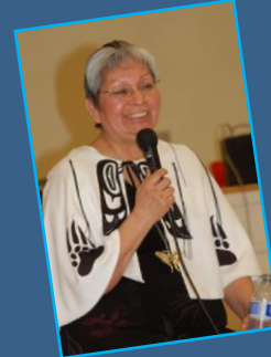
leeta at TFNG